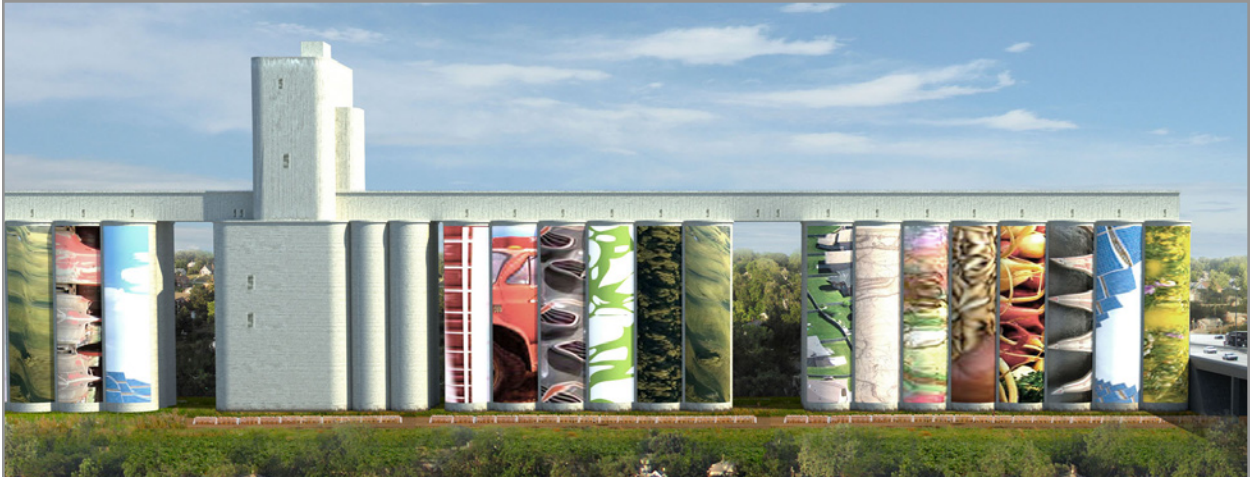
Min Day rendering